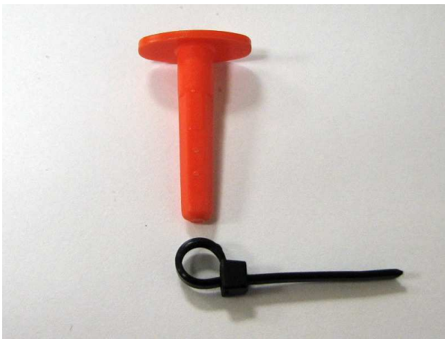
Figure 2. Cut the cable tie down to leave a one inch end. Cut the tie after placing it onto the stem so it will be easier to tighten