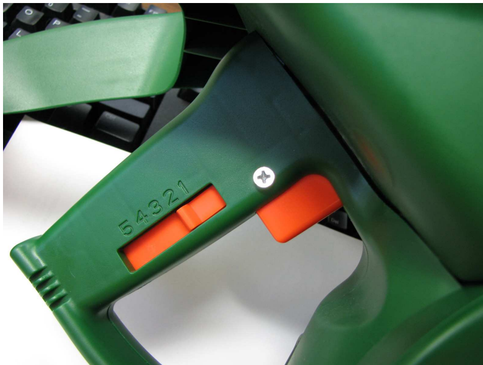
Figure 4. Screw holding the trigger permanently open.

Hold the trigger open at your desired setting. Usually #1 is sufficient, but a better position is half way between #1 and #2 2 . Then drill a small pilot hole and drive a self tapping screw through the assembly so the trigger remains open.