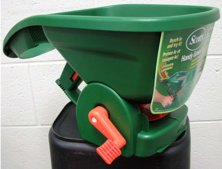
Figure 1. A Scott™ “Handy Green” fertilizer spreader