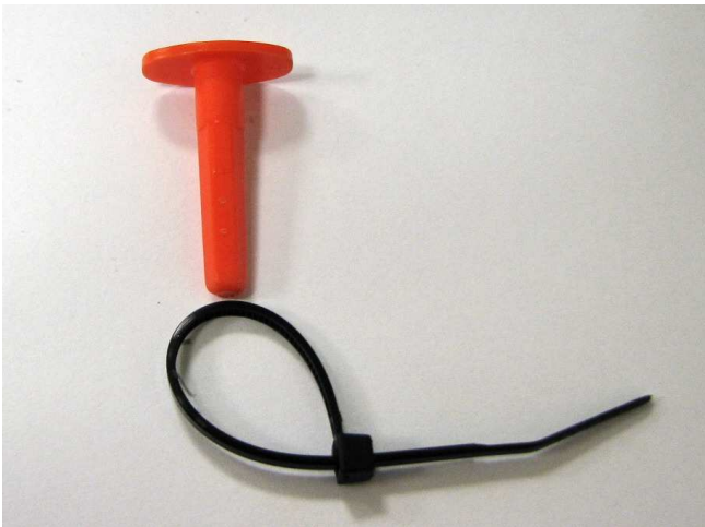
Figure 2. Cable tie ready to be placed onto the agitator stem.

The agitator is the orange plastic “T” shaped device in the bottom of the hopper. This can easily be pulled out. Wrap a small cable tie around the stem and tighten the tie as tightly as possible. Then cut it down so an inch or so is left sticking out. The cable tie should wrap around the stem in an anti-clockwise direction when viewed from above so when it is in the hopper, it is wrapped the way shown in the figures below.