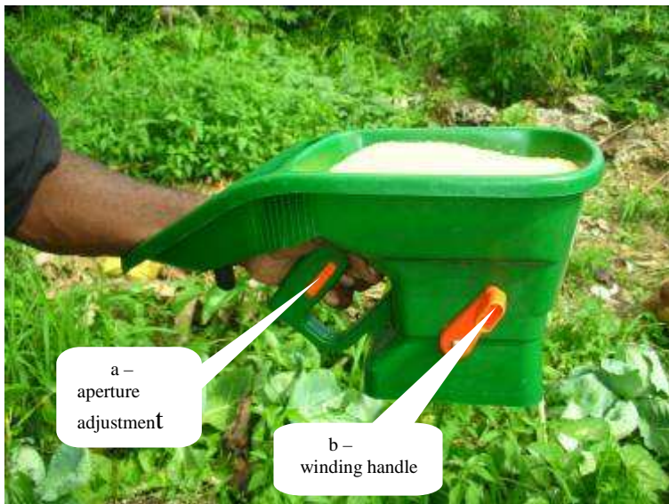
Image of a “Scott” bait spreader showing the winding handle (a), the aperture adjustment (b) and correct grip. Set the aperture at “1”.

The intent of treatment with granular baits is to deliver an even distribution of the bait over the soil surface at an approximate rate of 1 pound product per acre. Amdro and similar products are easily distributed using a “Scott” brand bait spreader. The aperture is set at “1” and the operator winds the spreader handle at approximately 60 rpm while walking at 2 mph. The swath width thus created is approximately 3-4 yards. An overlapping series of parallel swaths is recommended. This is accomplished by starting on one boundary of an infested site and proceeding 1 metre inside the boundary. Once the operator reaches the end of the treatment area, he or she takes 2-3 paces towards the untreated area and returns parallel to the original path (see Figure below). Continuing this process, the designated area can be systematically covered. It is important that all ground is treated including spaces between buildings and corners of gardens. An additional sweep around buildings, garden edges and other structures is recommended.